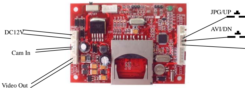
Image and file storage information