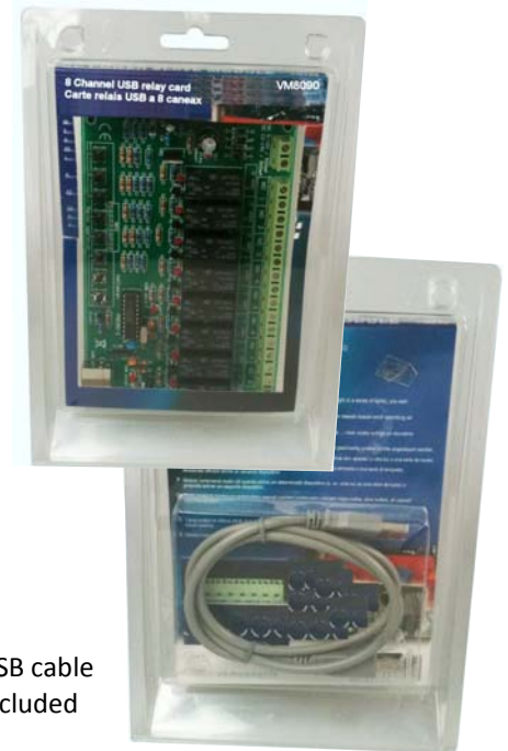
USB cable included