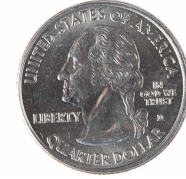
Sno Top View

The microcontroller core that we have developed has been designed to be easily extendable, and Alorium Technology has developed a support model for users who want to create their own XBs and interface to the on-chip microcontroller.